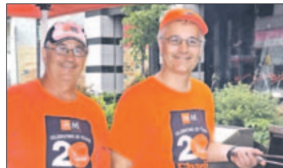
The "Bilodeau" Boys were serving up some hot treats

Event by Emily Brisson and SNAP Sudbury Event code: pe5unc